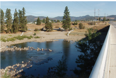
Looking North Toward the Site from the Harvard Road Bridge

The Washington Department of Ecology proposes to clean up lead, arsenic, zinc, and cadmium at the Harvard Road North site. The site covers less than one acre and lies along the northern bank of the Spokane River in Spokane County, Washington. It is nearly 3 miles west of the Idaho state line and immediately west of the Harvard Road Bridge. The proposed cleanup will begin summer 2008 and end by October 31, 2008. The area will be closed to the public during construction.