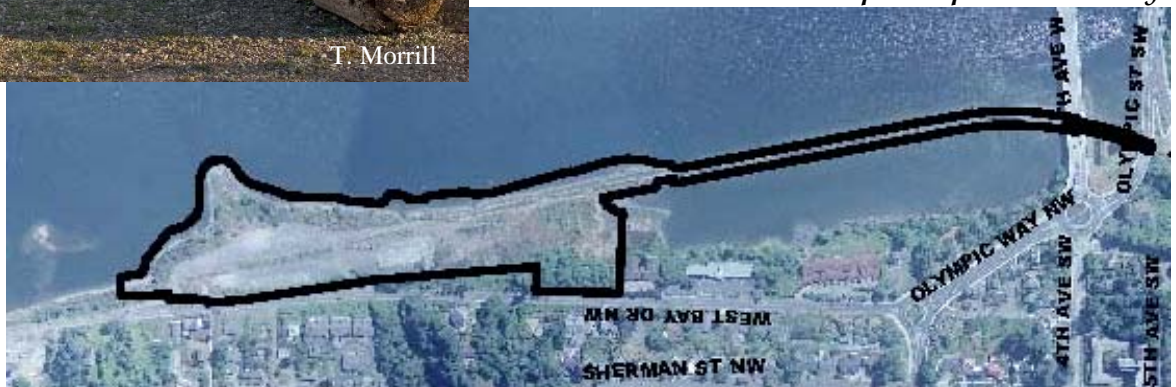
Proposed park boundary