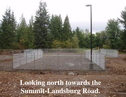
Looking north towards the Summit-Landsburg Road.

You may have noticed a new interior fence inside the gated area on property owned by Palmer Coking Coal Company along SE Summit Landsburg Road. In 2006, the Landsburg Mine Site Potentially Liable Persons (PLP) Group presented a plan to the Department of Ecology to install the basic infrastructure for an emergency treatment system for contaminated groundwater if it is ever detected at the site. To