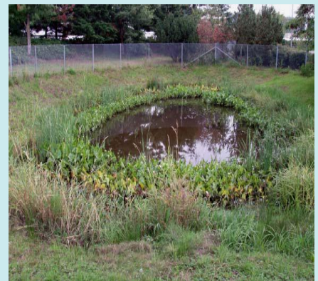
Constructed wetland near the South Renton Park & Ride

Stormwater treatment wetlands are shallow manmade wetlands that are designed to treat stormwater runoff through settling, filtering, and the biological processes of aquatic plants.