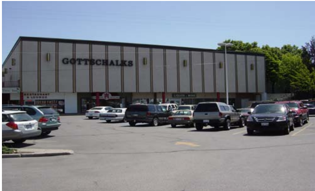
Looking at the west parking lot from Grand Avenue

The Manito Shopping Center site is located at 802 East 29 th Avenue, in the city of Spokane, Spokane County, Washington (Fig.1). It is made up of two parcels in the western parking lot near the Pear Tree Inn, Washington State Liquor Store, and Red Carpet Travel & Cruise (Fig. 2). Contractors addressed petroleum product and dry cleaning chemicals in soil under portions of the parking lot. This work was completed under Ecology's Voluntary Cleanup Program. Ecology plans to remove the site from the Hazardous Sites List as a result of the completed work.