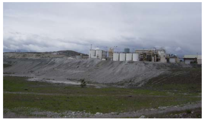
Looking north at the site from Sullivan Road

The Washington State Department of Ecology (Ecology) proposes to enter into an Agreed Order with Union Pacific Railroad (UPRR) to conduct a Remedial Investigation and Feasibility Study at the Aluminum Recycling Trentwood site. The site is located at 2317 North Sullivan Road in the city of Spokane Valley, Washington (see Fig.1).