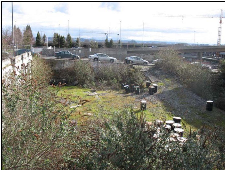
Sauro's Cleanerama, 1401 Pacific Avenue (facing east)

The Agreed Order is now available for you to review and comment on. The box to the right lists where to view the Agreed Order and how to submit your comments. Please submit comments from February 12 to March 16, 2009.