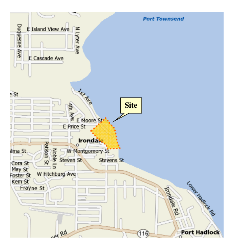
526 Moore Street, Irondale

If you need this publication in an alternative format, call (360) 407-6300. Persons with hearing loss, call 711 for Washington Relay Service. Persons with speech disability call 877-833-6341.