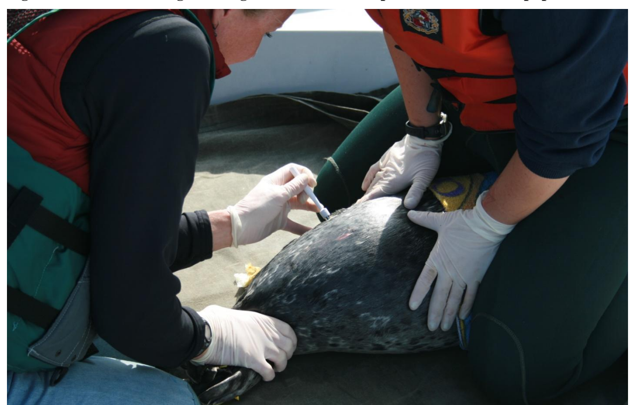
Figure 9. .Research biologist taking 8-mm blubber sample from harbor seal pup.