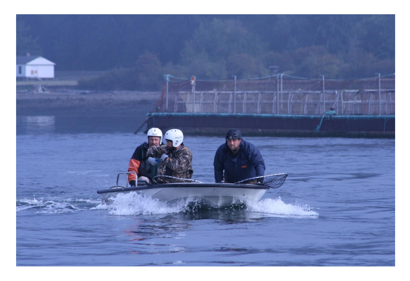
Figure 7. Capture team preparing for boat rush capture of harbor seal pups with salmon landing nets at Orchard Rocks in Central Puget Sound.