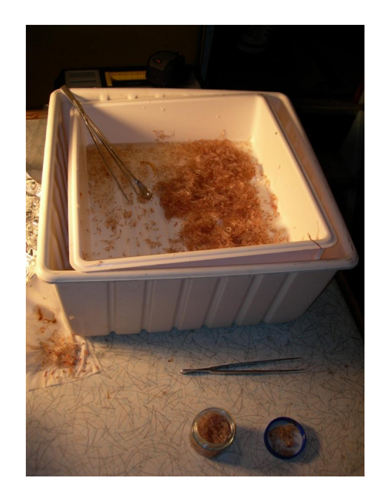
Figure 3. Isolated krill taxa (sample jar at bottom) picked from a mixture of macrozooplankton.

pre-cleaned, stainless steel sieves varying in mesh size from 500\mu m to 3,000\mu m. This mass will then be transported to a clean working table where the krill taxa will be isolated, using precleaned tweezers and/or stainless steel spatulas, and placed into 2-oz, pre-cleaned I-Chem brand sample jars (Figure 3). Multiple sample jars (up to six composites) will be collected per sample site. Sample jars will be labeled, placed on ice immediately, and frozen to at least -20 °C within 72 hours of collection. Composites will remain frozen until analyzed in the laboratory.