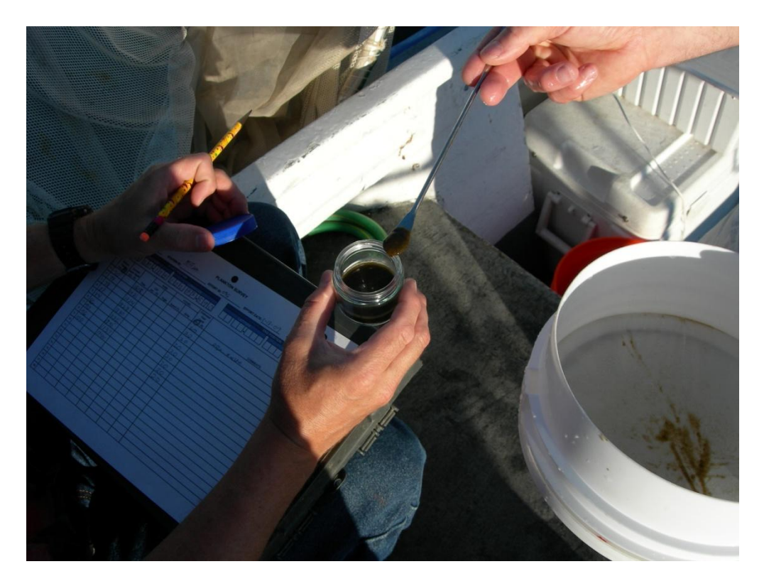
Figure 5. Collection of particulate organic matter (POM) paste concentrated on a 20-µm sieve.

The phytoplankton net will be cleaned between sampling areas and transported on the boat in a sealed tote to minimize the risk of contamination from boat-engine exhaust fumes. All sampling gear will be washed using soap and freshwater between sampling basins.