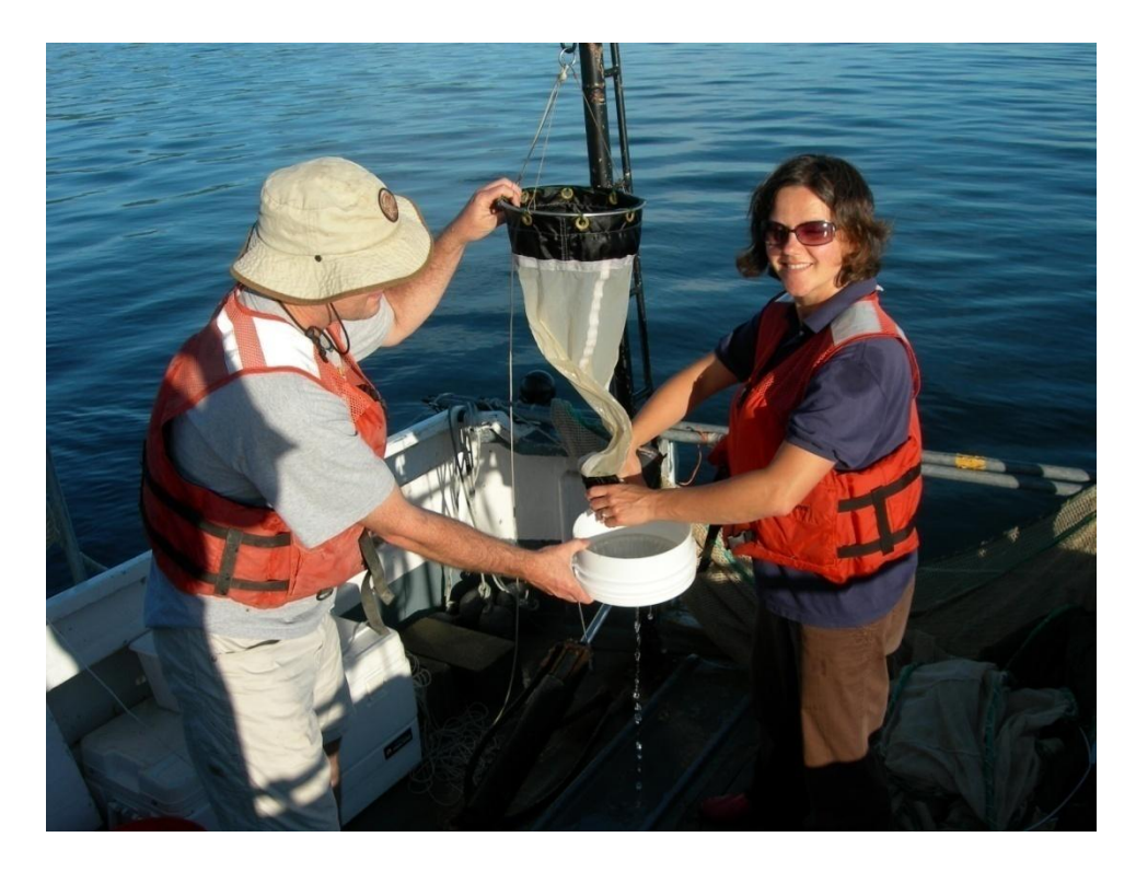
Figure 4. Conical plankton sampling net (20 µm mesh pore size) used to sample particulate organic matter.

Each sampling effort will consist of vertical lifts from near bottom or a depth of 25 m (whichever is shallower) to the surface. Lifts will be made from a drifting boat to minimize the effects of currents on net performance. The boat engine will be switched off prior to sampling to avoid contamination of gear and samples by exhaust fumes. Depth will be measured using marks on the nylon line and volume filtered will be calculated using the measured depth. After the net ring breaks the surface, the net will be lifted out of the water slowly enough to allow some drainage of seawater through the mesh.