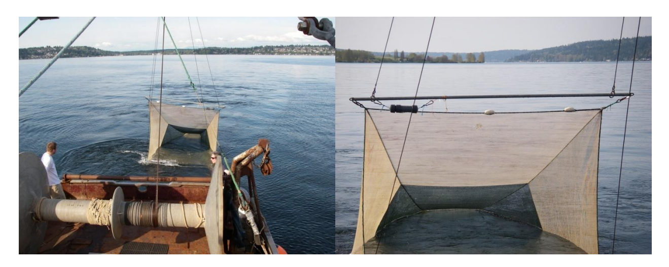
Figure 2. Modified Kvichak net being launched for macrozooplankton sampling.

A sonar depth sounder (Furuno or SIMRAD) set at 50 and 200 kHz will be used to locate deep scattering layers (potential krill "sign"). Once krill sign is seen on the depth sounder, a target sampling depth will be determined and length of trawl line calculated. A ratio of approximately 2:1 (line:net depth) will be used to reach the target depth. The net will be fished at approximately 2 knots (boat speed) for 5 to 30 minutes, depending on the strength of the signal observed. A ReefNet Inc. Sensus Ultra dive data logging device, attached to the Kvichak's upper net beam, will be used to record the actual depth sampled. Recorded depth information will be downloaded and viewed immediately after each tow to verify sampling depth and make any needed corrections for subsequent tows.