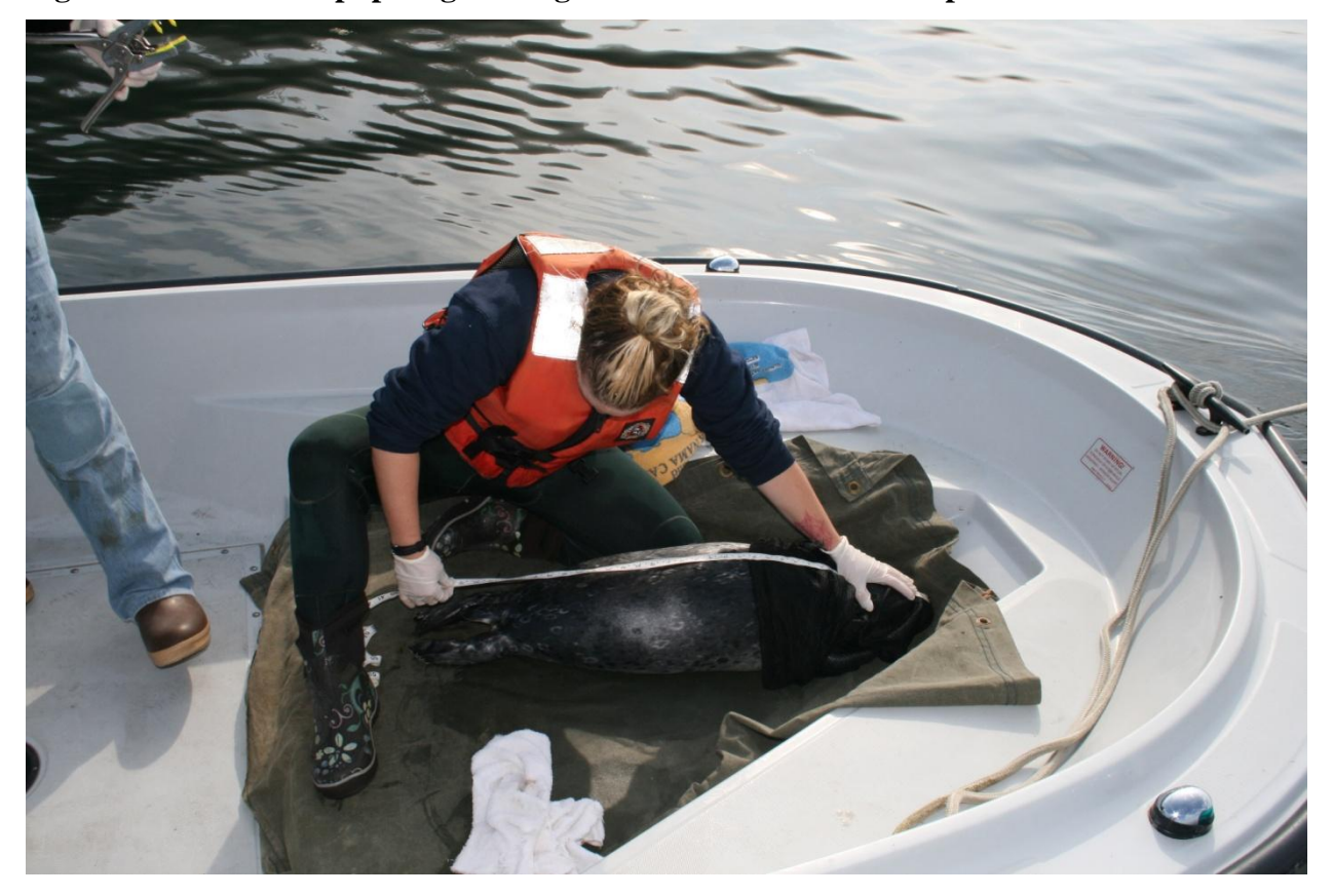
Figure 8. Harbor seal pup length being measured in the bow of capture boat.

mercury. These samples will be stored at room temperature until analysis by laser ablation ICP-MS. Harbor seal research activities will be conducted under Marine Mammal Protection Act Research Permit 782-1702-05.