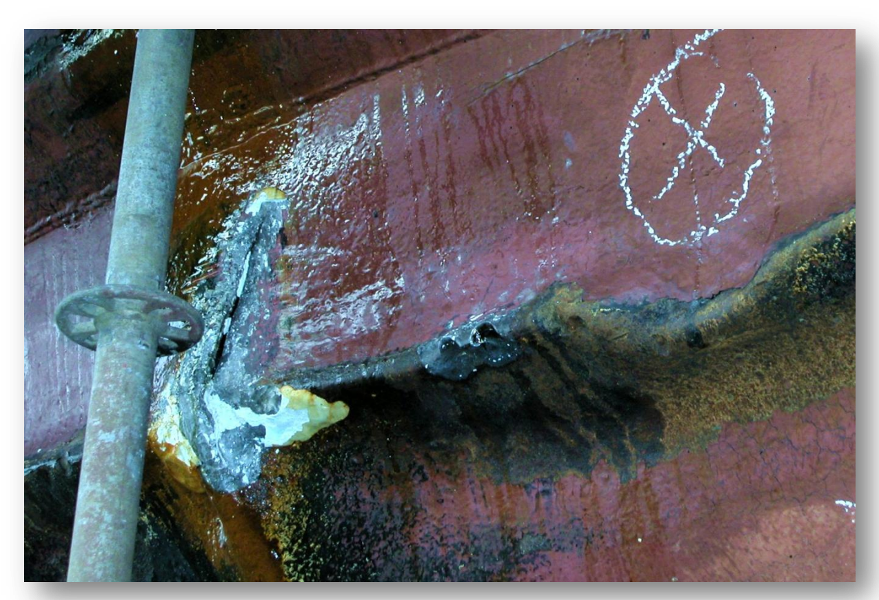
Damaged caused to the hull of a single-skinned tank barge as the result of hard contact between the tug and barge during berthing in rough weather. Oil leaked from the fracture upon loading the barge.