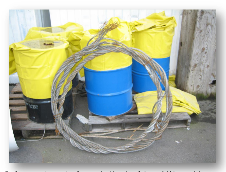
Broken tow wire section from an incident involving a drifting tank barge.

If you need this publication in an alternative format, call the Spills Program at 360-407-7455. Persons with hearing loss, call 711 for Washington Relay Service. Persons with a speech disability, call 877-833-6341.