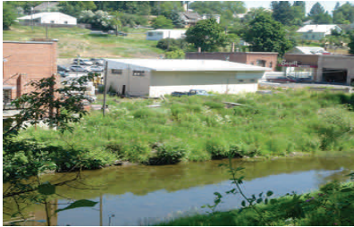
Southern view of the property

The City of Palouse, in an agreement with the Washington Department of Ecology, proposes to clean up petroleum products and metals such as lead, arsenic, and manganese at the Palouse Producers site. After cleanup is completed the City of Palouse proposes to redevelop the site. The site is located at 335 East Main between Bagott Motors and the new Health Center building (Fig. 1). The southern portion of the property is along the bank of the Palouse River.