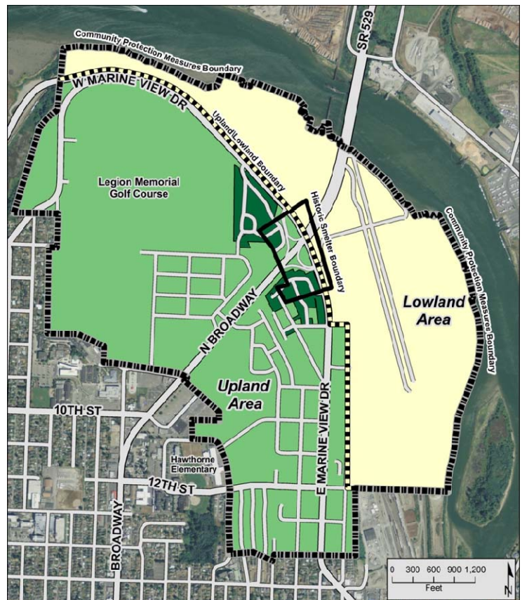
Everett Smelter Cleanup Site, Everett

If you need this publication in an alternative format call reception at 425-649-7000. Persons with hearing loss, call 711 for Washington Relay Service. Persons with a speech disability, call 877-833-6341.