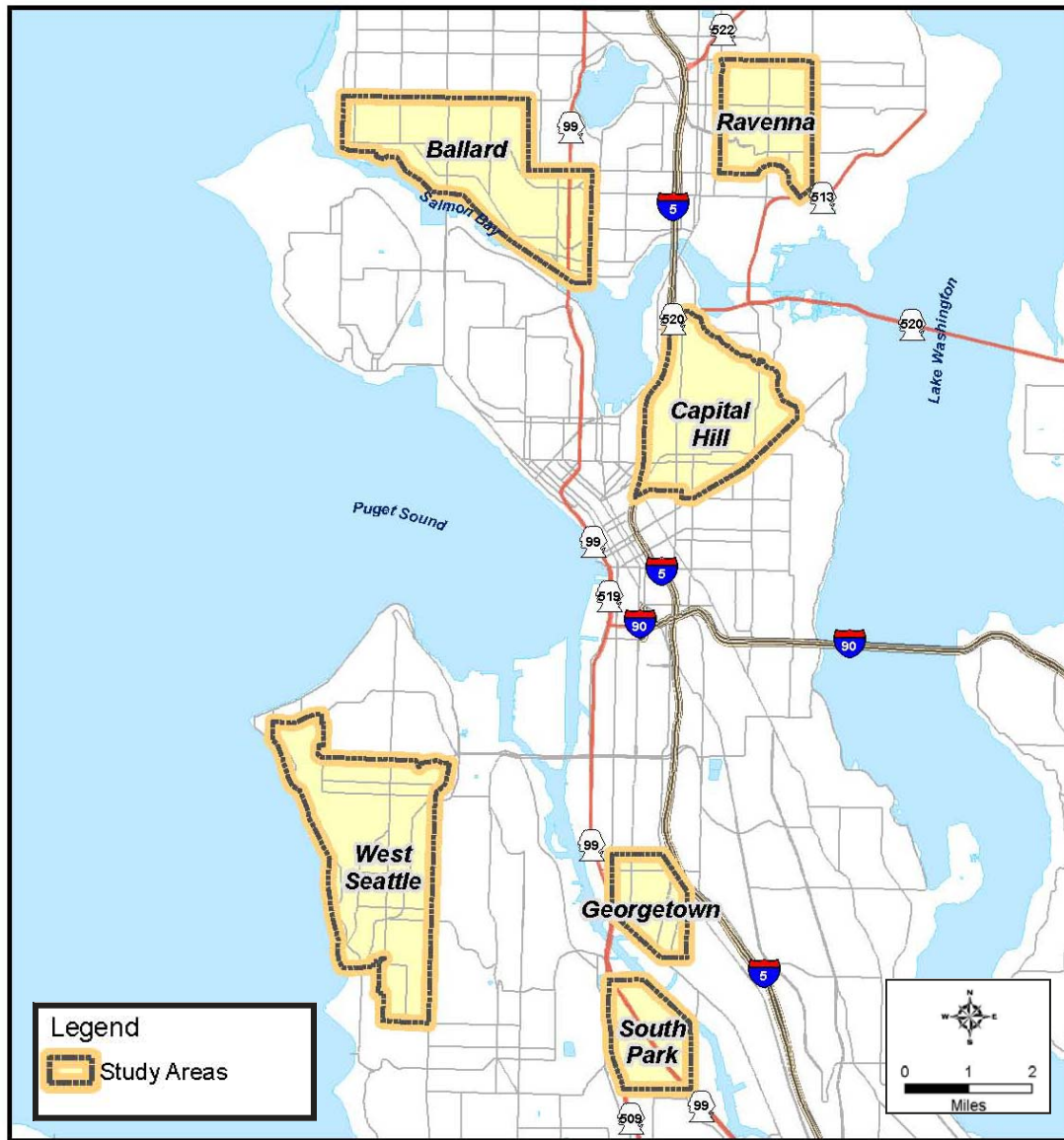
Figure 2. Seattle urban soil dioxin study area.