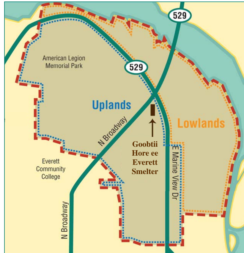
Goobta Nadiifinta Everett Smelter, Everett

Haddii aad u baahan tahay in daabacadaan laguugu siiyo qaab kale, wac soo dhaweynta oo laga helo telefoonka 435-649-7000. Dadka maqalkooda yar yahay, wac telefoonka 711 si aad u heshid Adeegga Gaarsiinta (Relay Service). Dadka qaba itaal darrida hadalka, wac telefoonka 877-833-6341.