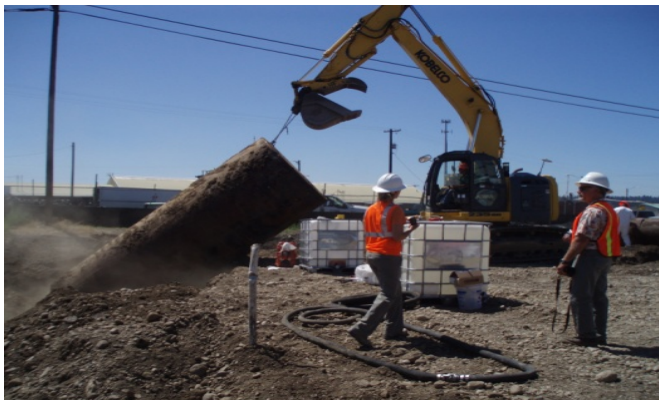
The City Parcel site cleanup on North Cook Street

Other projects have been undertaken to reduce PCBs in the environment. The following are examples of projects in the Spokane area that are either adjacent to the river or could affect the river because of contaminated groundwater or contaminated stormwater runoff.