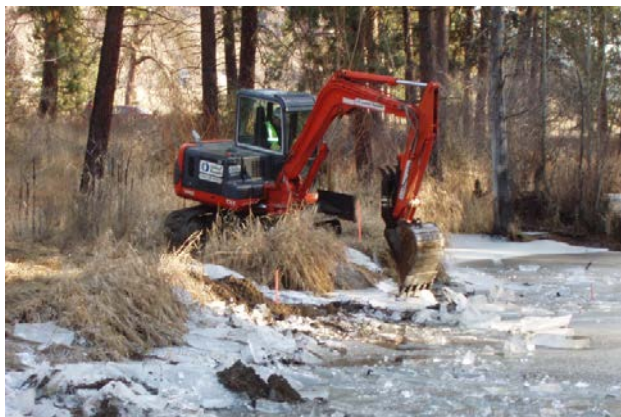
Restoring Donkey Island

This project is east of the dam in wetlands and backwater channels found on the north bank of the river. Ecology provided oversight as contractors removed PCB-contaminated soil and restored the area with clean sand. Areas disturbed during PCB removal were replanted in the spring of 2007.