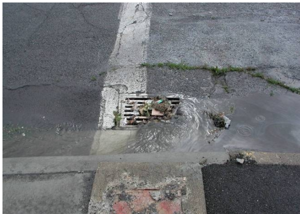
A typical storm drain with dirt and debris that winds up in lakes, streams and rivers.

Stormwater – or polluted runoff -- is what results when it rains hard or during a fast snow melt. The water carries pollution on the land into downstream waters. Stormwater is a leading contributor to toxic pollution problems in the Spokane River.