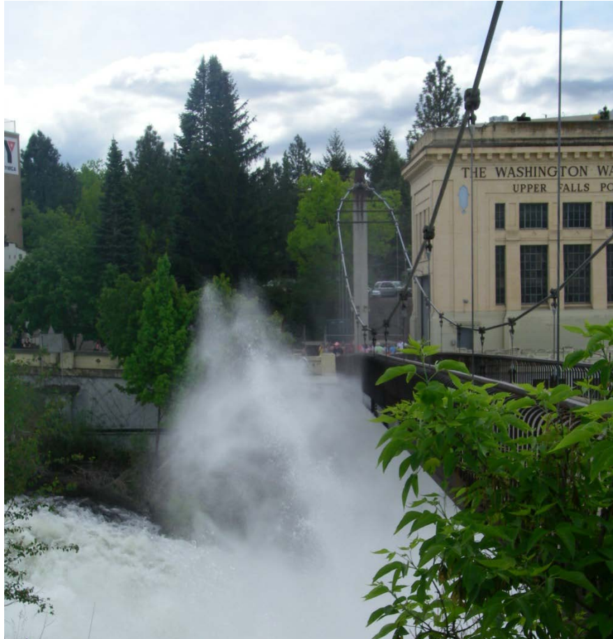
The river at the old Washington Water Power site in downtown Spokane

The major elements of Ecology's toxics reduction strategy are described below, including efforts by the Environmental Assessment, Urban Waters, Water Quality, Toxics Cleanup, and Hazardous Waste and Toxics Reduction programs. The strategy elements include keeping up-to-date with the science, learning from where the toxics are coming, and reducing those upland sources. Other elements include writing new permits for industrial and municipal dischargers and more on-the-ground cleanup work on the beaches or upland sites where toxic pollutants are a threat to the Spokane River.