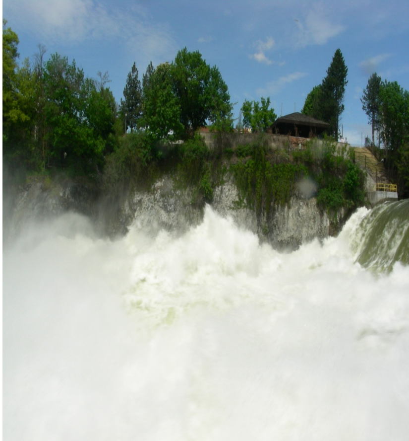
Spokane Falls in the middle of the city during spring runoff