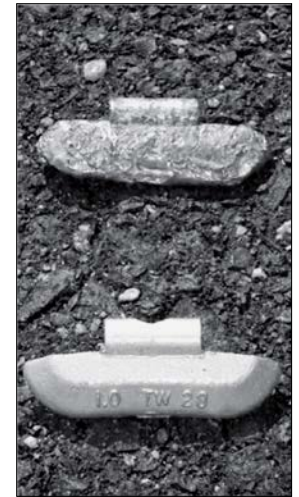
Ground-up lead wheel weight next to a new lead wheel weight

When you remove lead wheel weights, you must recycle them properly. Visit Ecology's web page for locations.