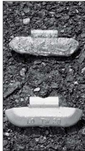
Ground-up lead wheel weight next to a new lead wheel weight

When you remove lead wheel weights, you must recycle them properly. Visit Ecology's web page for locations.