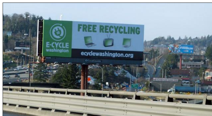
A January 2012 billboard on I-5 near the Tacoma Dome raised public awareness about free recycling for electronics through E-Cycle Washington.