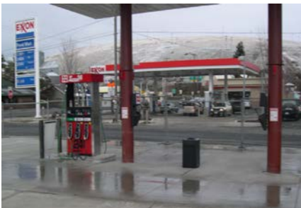
North Colfax Petroleum Site

The site includes several parcels, currently or previously occupied by gasoline stations. Petroleum leaks from operations at the site contaminated soil and groundwater requiring further investigations and the development of cleanup options.