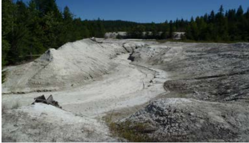
Location of recent major erosion in 2012

The Washington Department of Ecology is beginning work the week of October 22, 2012 to prevent possible breaching of the Upper Tailings Pile of the Van Stone Mine site. The site is located 24 miles northeast of the city of Colville off Van Stone Road in Stevens County, Washington (Fig.1).