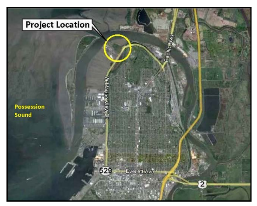
Figure 1 (left). The Bay Wood Products Site is located at 200 West Marine View Drive on Port Gardner Bay in Everett, WA. (Figure 1-1 from the RI/FS)

We appreciate your comments and concerns. Thank you.