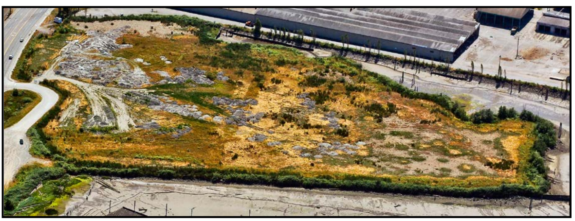
Figure 2 (below). Aerial photo of the Bay Wood Products Site on-site soil stockpiles.

Figure 1 (left). The Bay Wood Products Site is located at 200 West Marine View Drive on Port Gardner Bay in Everett, WA. (Figure 1-1 from the RI/FS)