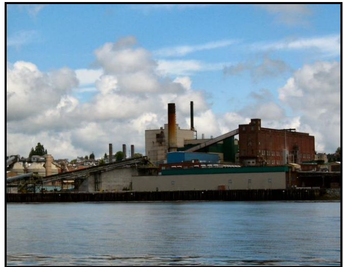
2012 photo of the Kimberly-Clark Worldwide Site looking northeast from East Waterway.