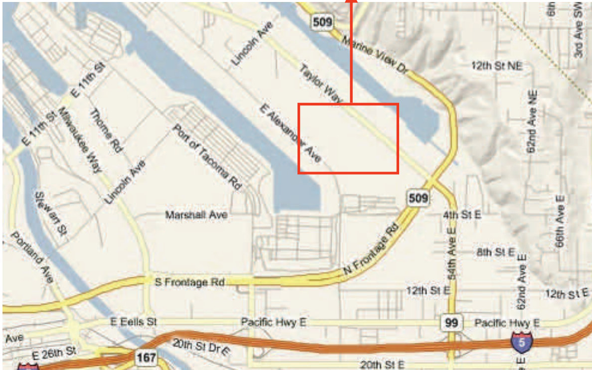
Port of Tacoma Kaiser site, 3400 Taylor Way, Tacoma WA