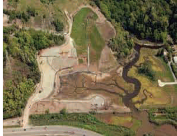
Aerial views of the site showing habitat restoration. Left: July 2010. Right: June 2011