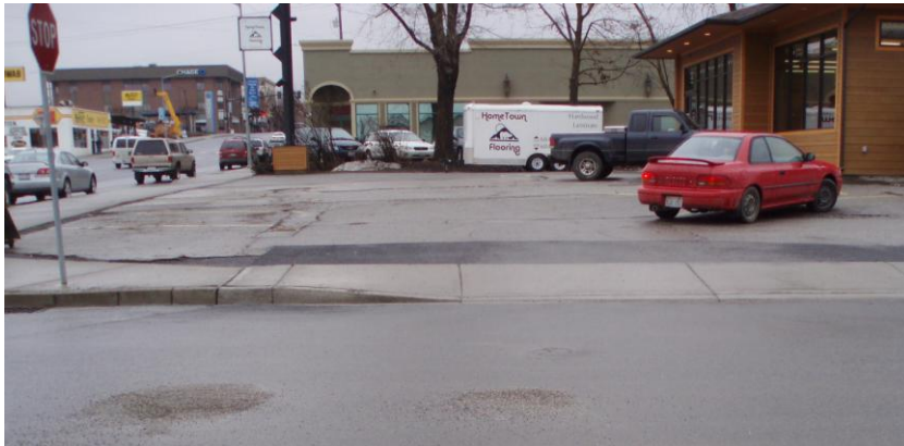
Former Whitty's Minimart Location

Ecology has taken several steps at the site to cleanup soil, groundwater, and surface water contamination. Air quality issues resulting from gasoline vapors were also addressed at the site. Cleanup criterion has been met over an extended period of cleanup actions and monitoring since 1984. Ecology now proposes removing the site from the Hazardous Sites List.