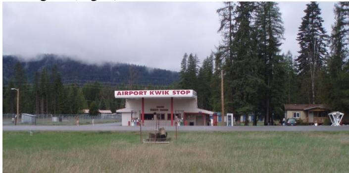
Airport Kwik Stop Site

The site begins west of Highway 31 and north of Greenhouse Road and extends generally east and southeast toward the river in Ione, Pend Oreille County, Washington (Fig. 1).