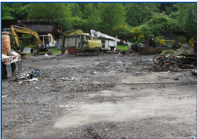
The Oline Storage Yard.

The estate will backfill the excavated areas with clean material. They will test excavated and remaining soil to ensure state cleanup levels are reached.