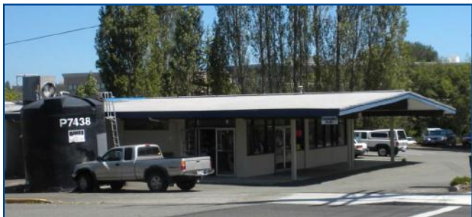
(Former) Olympia Dry Cleaners at 606 Union Ave