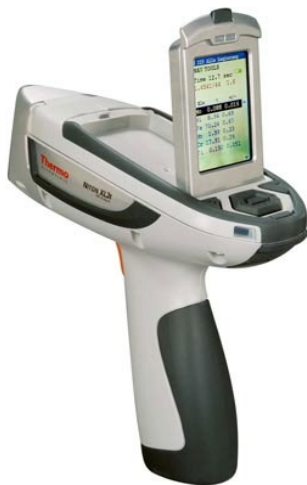
Figure 1. Niton Portable XRF

Individual components of packaging will be screened using a Niton XL3t portable XRF analyzer (Figure 1) following the instrument manufacturer recommendations and procedures described in Ecology's Product Testing Procedures (Ecology 2015). 5