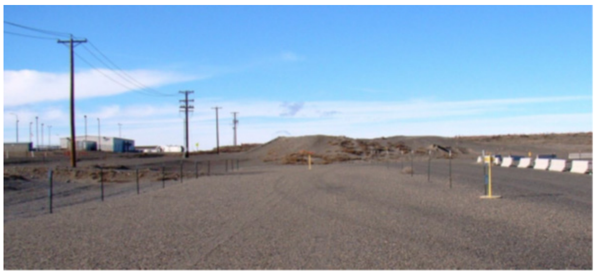
The FS-1 storage area is on the south side of LLBG 218-W-5 Trench 34 in Hanford's 200 W Area

Class 3 Modification - A Class 3 permit change is for the most significant of changes. It requires a permittee-led comment period on the proposal, then an Ecology-led comment period on the draft permit change.