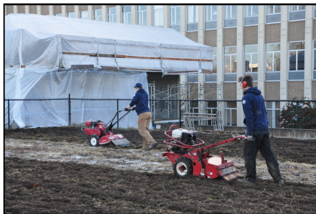
Tilling garden plots after spreading compost and lime.

January kicked off a great start to 2015, with myself and 11 other Individual Placements participating in farm work for the Kiwanis Food Bank Garden and helping out at GRUB; a local community garden, for MLK Day. Our group weeded, spread manure, limed fields, turned compost, removed blackberry, moved downed trees from the property and overall got down and dirty to make a difference! Volunteering at these places was an excellent way to give back to my community because each organization has created activities and programs that benefit various groups of people in Olympia. The Kiwanis garden grows a large supply of fresh vegetables for the food bank downtown and GRUB participates in CSA boxes, helps build garden boxes for people, and has developed their own school for youth to come learn about gardening and social issues affecting the world today. Volunteering for these organizations was an incredibly satisfying way to spend MLK Day and I feel like I have truly helped my community.