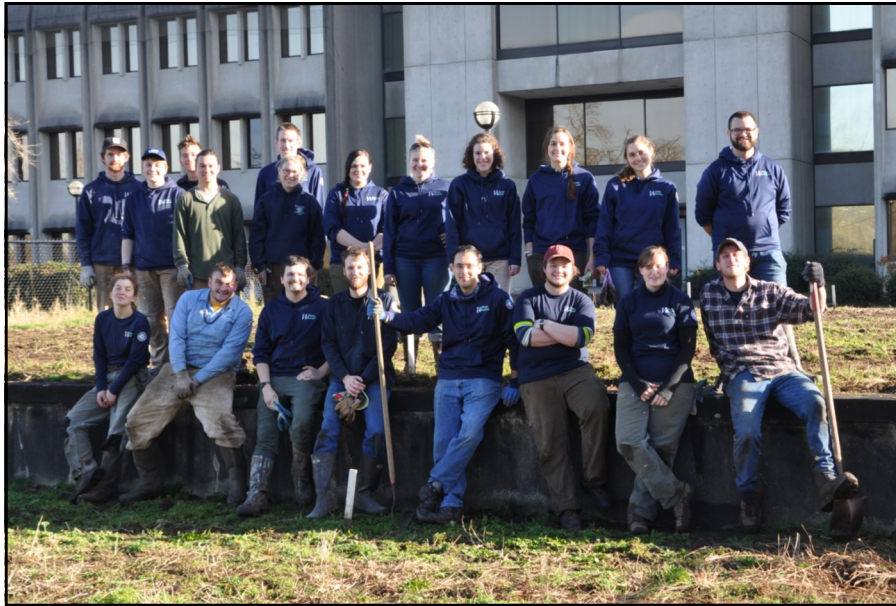
IP's and Crew Members pause for a picture while working at the Kiwanis Garden.