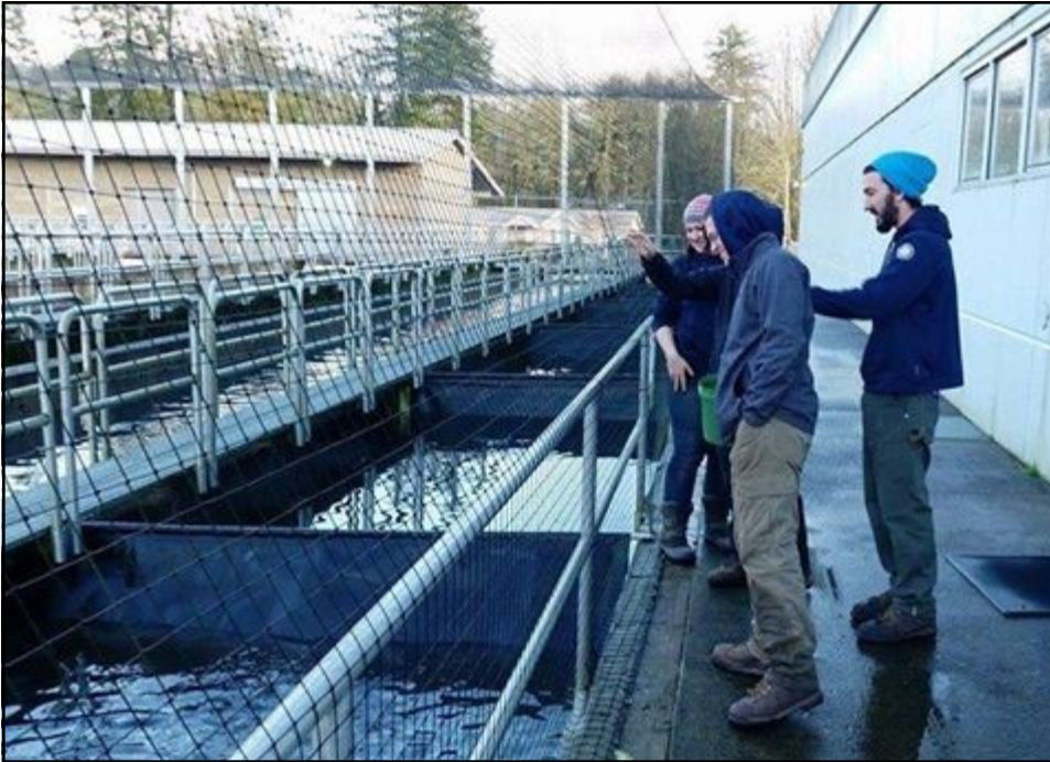
Learning about the Cowlitz Hatchery after a rewarding day volunteering with the Tacoma Power Company.