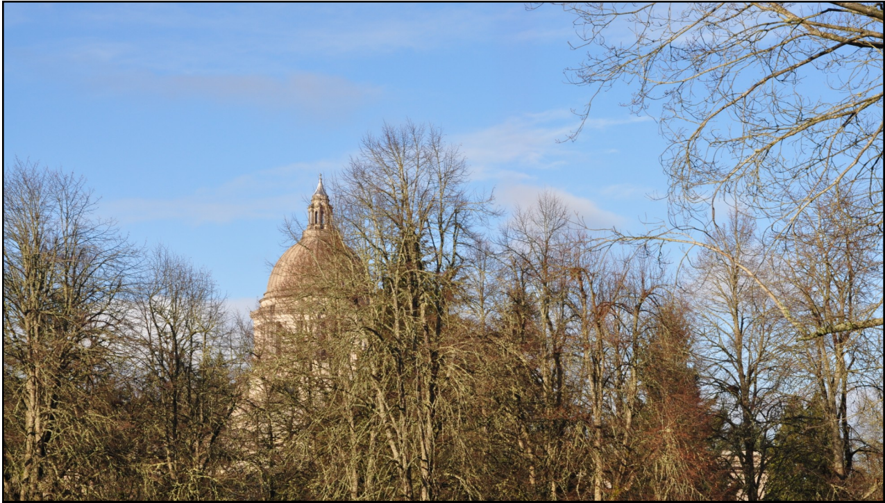
Clear winter day in Olympia.