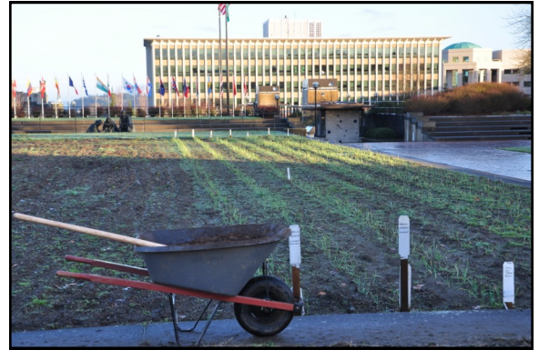
One of the 4 Kiwanis Garden plots on the Capitol Campus