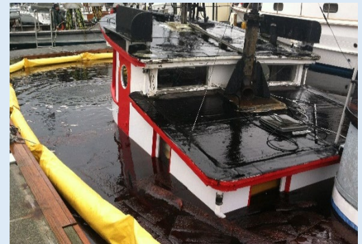
Tug Chickamauga sinking and diesel spill, Bainbridge Island, 2013.