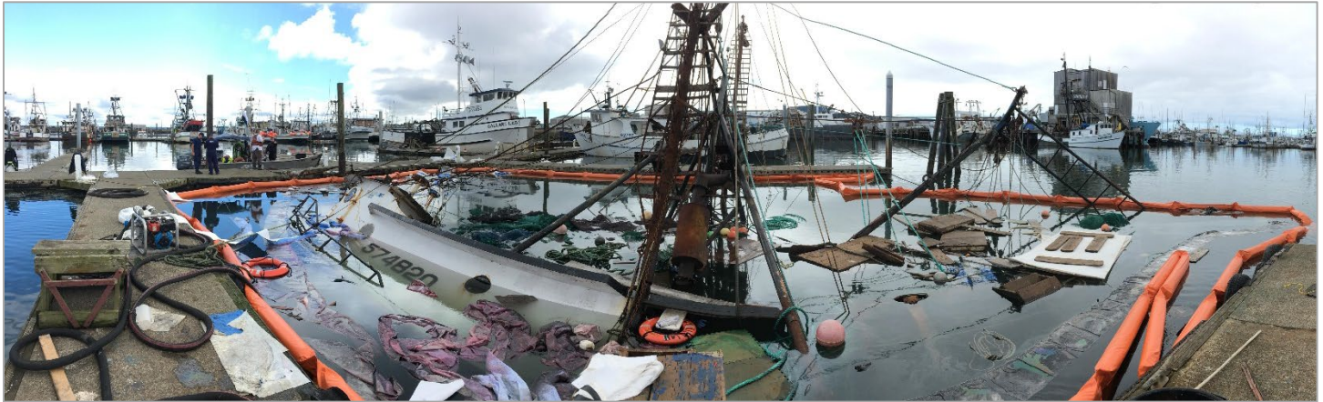
Fishing vessel Lady Lilian sinking and spill, 2016, Westport, Wash.