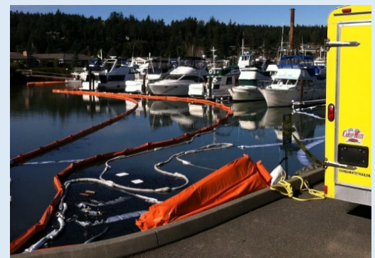
Boom and sorbent material deployment from trailer, Shelter Bay Marina Fire, 2014, La Conner.