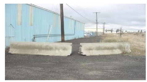
Alleyway East of Former Building

PCB contamination was found inside the building in dry wells, on building materials, in an underground storage tank, and in drain lines. Studies showed the groundwater was not impacted, but there was extensive contamination in soil from 0 to 12 inches below the ground. surface. Contaminated soil was located in the gravel parking area on the north side of the building and in the alleyway east of the property