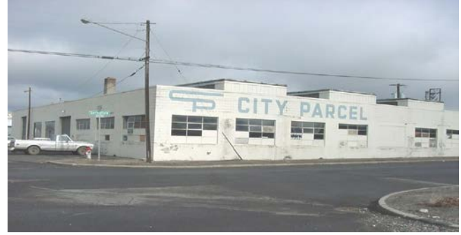
Former City Parcel Building at the corner of Cook Street and Springfield Avenue

Access to the area where soil work will be conducted, in the City of Spokane right-of-way for North Cook Street, has been obtained. Ecology will begin remediation after public comment has been considered.