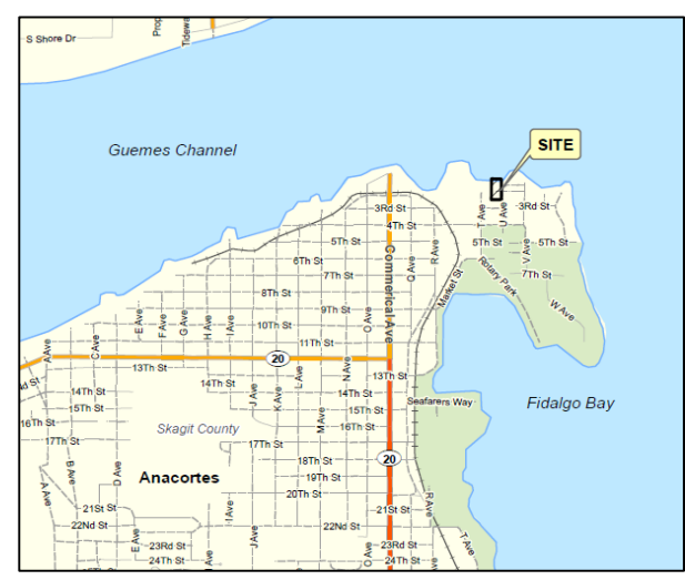
Wyman's Marina and Wholesale Supply is located at 202 U Avenue in Anacortes.

Facility Site ID #: 2821735 Cleanup Site ID #: 2097