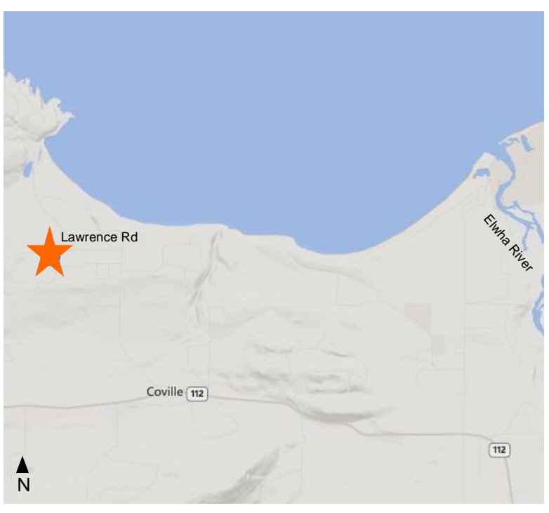
US DEA OPNTF Lawrence Rd Port Angeles site 157 Lawrence Rd, Port Angeles

Persons with impaired hearing may call Washington Relay Service at 711. Persons with speech disability may call TTY at 877-833-6341.