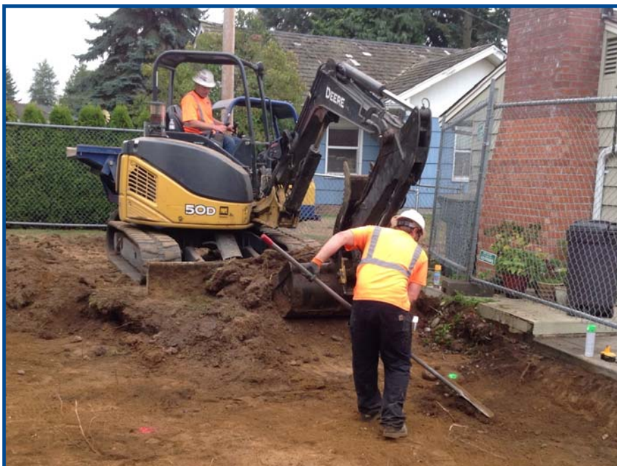
Contaminated soil being removed on a residential property as part of the uplands cleanup.