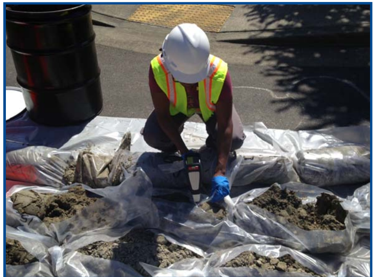
Ecology staff sampling soil.

A public comment period will be held for the RI, FS, and Draft Cleanup Action Plan in late 2015. The Cleanup Plan will be finalized after the comment period. Cleanup work is tentatively scheduled to begin in 2017.