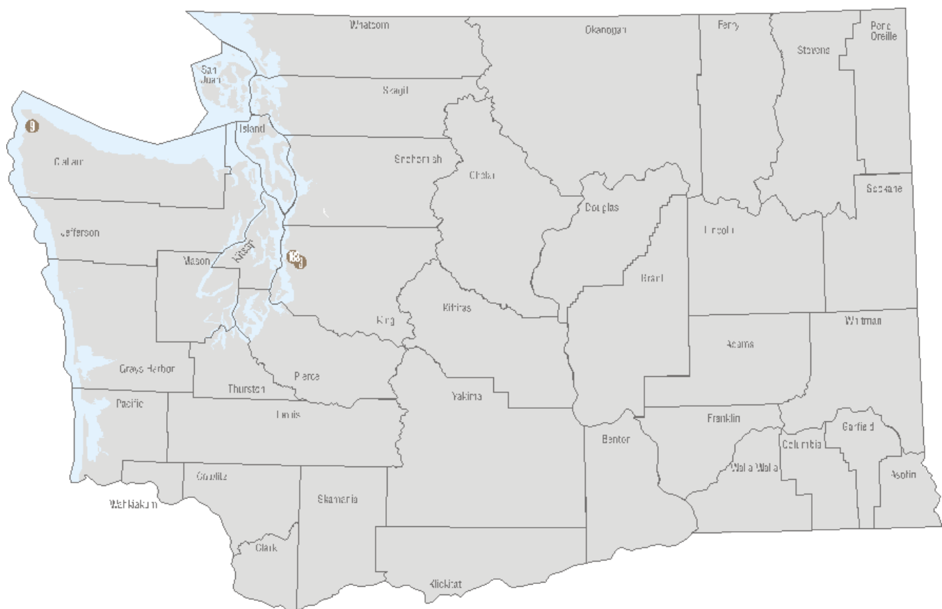
Figure 5. Map of Washington SO 2 sites

Recommendations/Proposed Modifications: None.