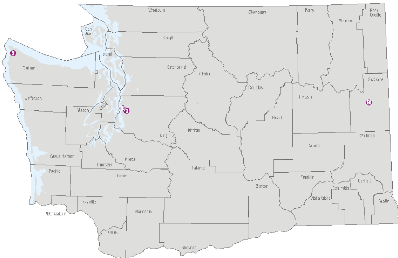
Figure 2. Map of Washington CO sites

Revision for the Spokane County Second 10-Year Limited Maintenance Plan for Carbon Monoxide. The monitor will be retained pending final approval of the Plan.