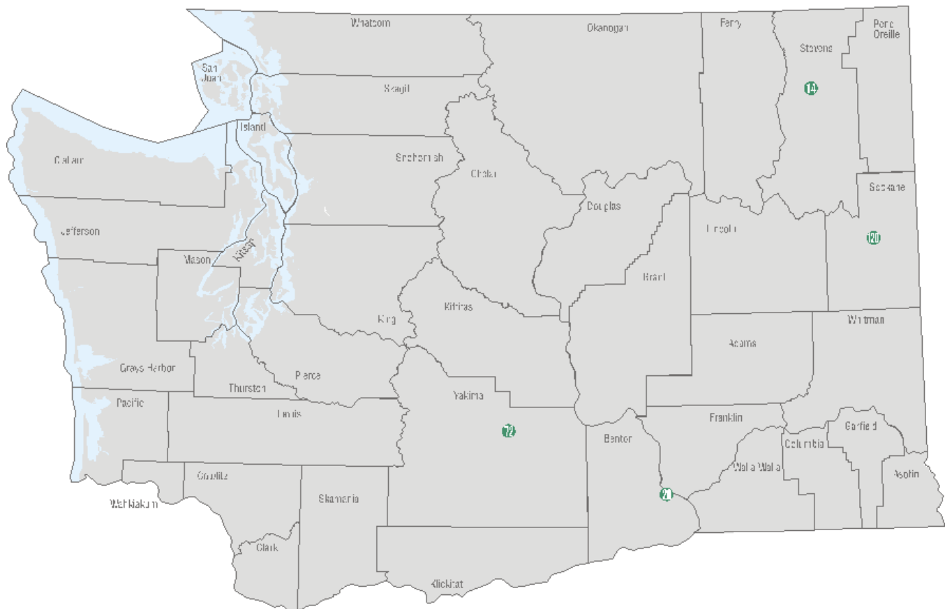
Figure 6. Map of Washington PM 10 sites

A 5-year PM 10 design value below 98 µg/m 3 demonstrates the Spokane County Maintenance Area continues to qualify for the LMP approach. The 5-year PM 10 design value estimate for 2010–2014 was 80 µg/m 3 . For the 3-year compliance with the PM 10 NAAQS, the form of the standard is the number of 24-hour exceedances of 150 µg/m 3 , averaged over three years. The 2015 PM 10 design value for Augusta Avenue (530630021) is 0.4. This design value is in attainment with the standard, which is not to exceed one. However, reroofing caused the monitor to be shut down for July 17 through September 18. Data capture for the third quarter was only 30 percent. The Spokane County Maintenance Area complies with the PM 10 NAAQS and continues to meet EPA's LMP qualification criteria.