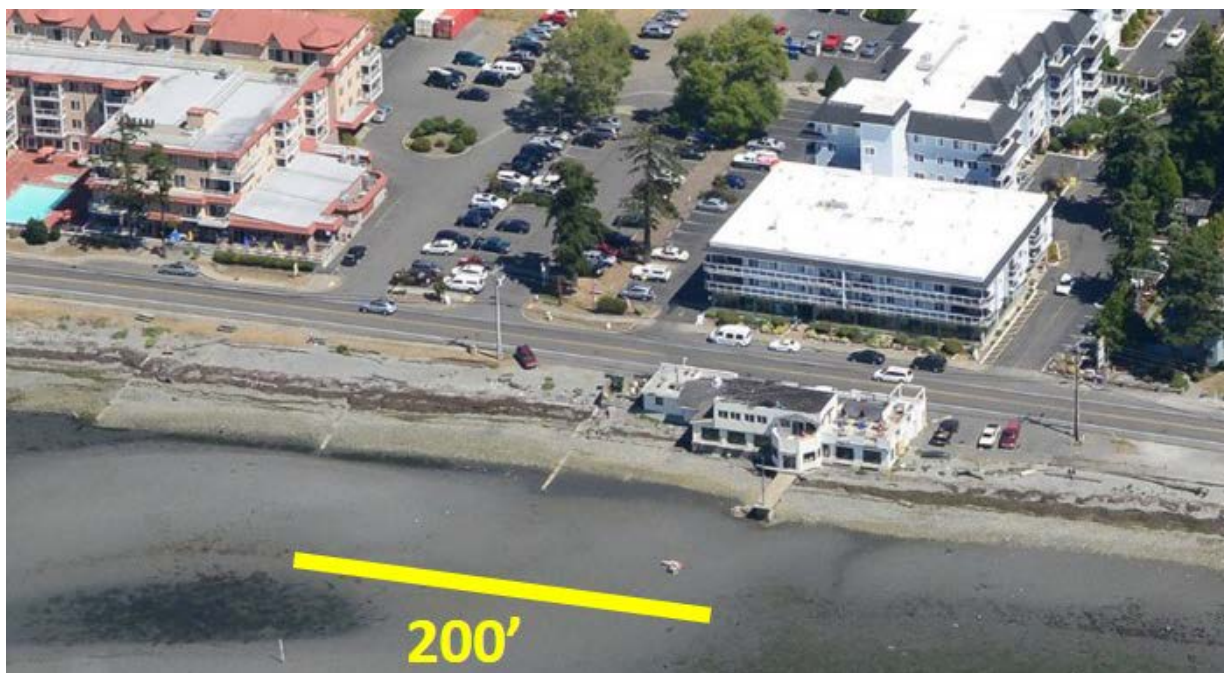
Figure 5 – Comparison of full image and zoomed in portion. August 2016 photos, from Birch Bay, Whatcom County.