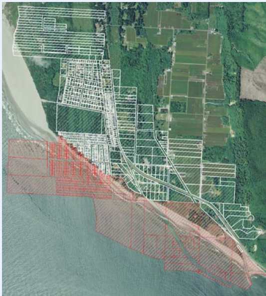
Figure 3 – Map of Parcels from the Pacific County Assessor's Office; Red parcels have lost at least 50% of land mass to shoreline erosion as of May, 2015.

Reliable data and information on erosion rates provides the basis for understanding risk and evaluating alternative approaches. However, Washaway Beach is a unique confluence of interacting physical conditions that remain only somewhat understood. Scientific studies are a significant investment and often do not occur as frequently as needed. Photos are used in the absence of scientific studies to monitor shoreline changes and communicate the severity of erosion loss.