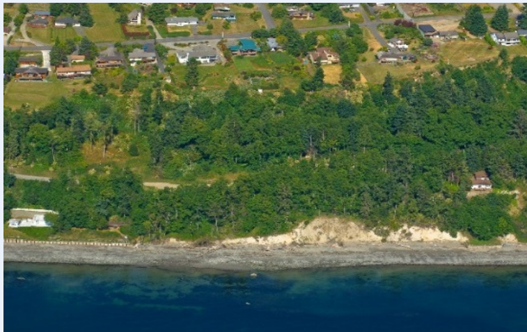
Figure 9 – Ecology oblique image 2006

Ecology's photos are regularly used in public presentations and workshops to illustrate a wide variety of coastal features in addition to hazards such as landslides. They provide a familiar, easy to understand view of shoreline habitats, development practices, and waterfront industries.