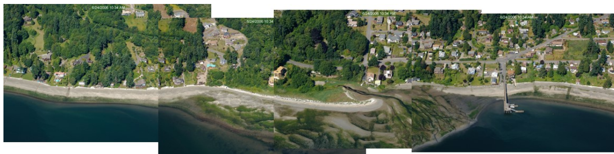
Figure 1 – Series of four photos illustrating continuity of coverage and typical overlap between images.

Each series of the photos captures the entire shoreline, leaving no gaps. Some alternative photo sources include only select segments of shoreline based on specific features or characteristics. Ecology's continuous series is better for conducting inventories of shoreline features and development. It also helps provide a broader shoreline context. The Washington Coastal Atlas allows users to easily navigate intuitively through photos along the shoreline and it also allows them to print large images with long, continuous segments of shoreline all at once (Figure 1).