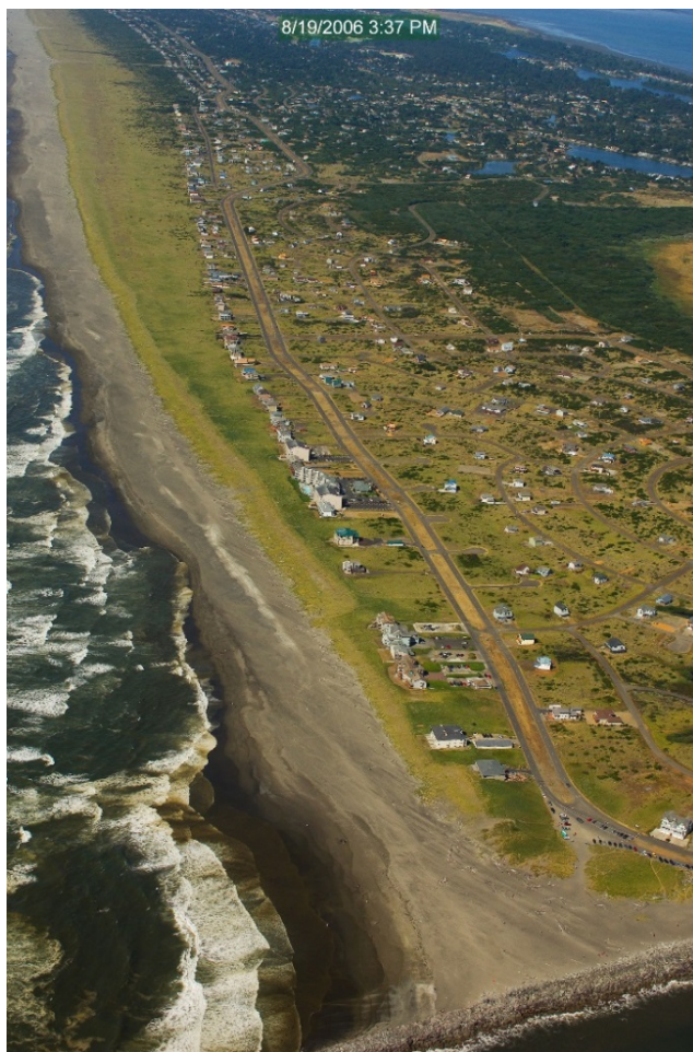
Figure 7 – View north of Ocean Shores