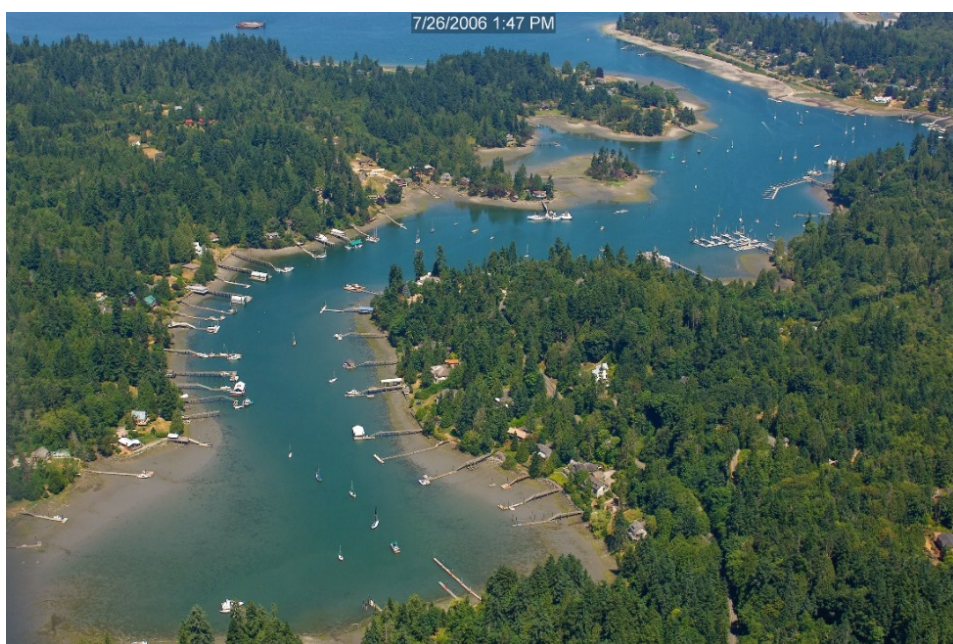
Figure 8 – Port Madison Bay on Bainbridge Island