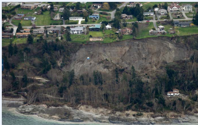
Figure 10 March 29, 2013