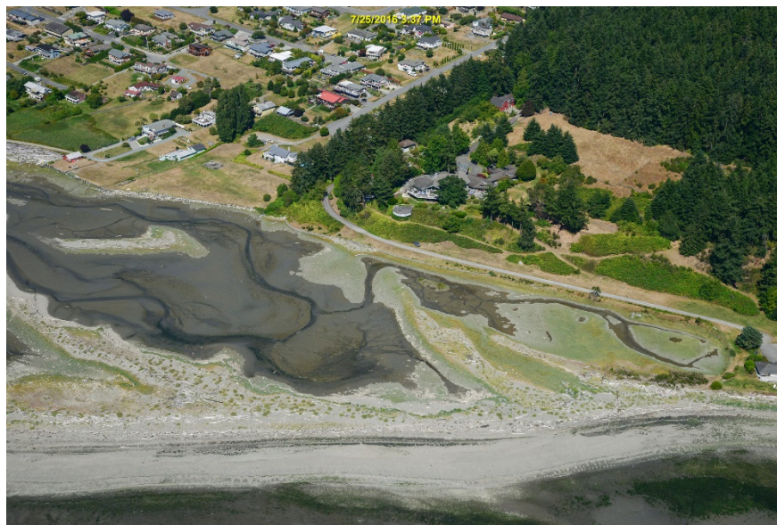
Figure 2 – Oblique views provide unique perspective the shoreline itself, along with complex natural features and upland land use.

Ecology's oblique photos offer a perspective of shorelines that is particularly helpful for viewing coastal bluffs and forested shorelines, identifying landslides, and characterizing shoreline modifications (including steep structures such as bulkheads and stairways, which can be particularly difficult to identify in vertical imagery) and overwater structures such as piers and wharves.