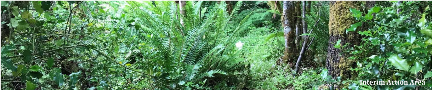
Interim Action Area