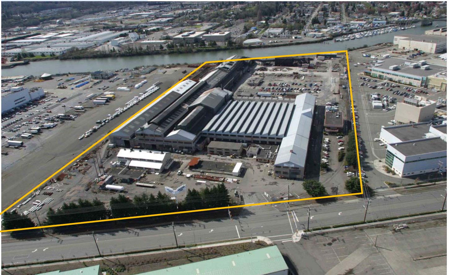
Figure 1. Aerial photo of Jorgensen Forge site and LDW, showing approximate site boundaries

Ecology is leading efforts to control sources of contamination from the surrounding land area. The long-term goal is to reduce recontamination of the river sediment and restore water quality in the river.