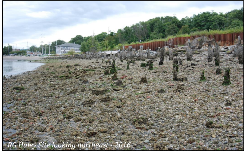
RG Haley Site looking northeast - 2016

To address the contamination found at the site, a number of appropriate technologies were combined into six different cleanup options for the upland portion of the site (Upland Unit), and six different cleanup options for the marine sediment portion (Marine Unit). The options then went through a cost/benefit analysis, which identified a preferred cleanup option for each unit.