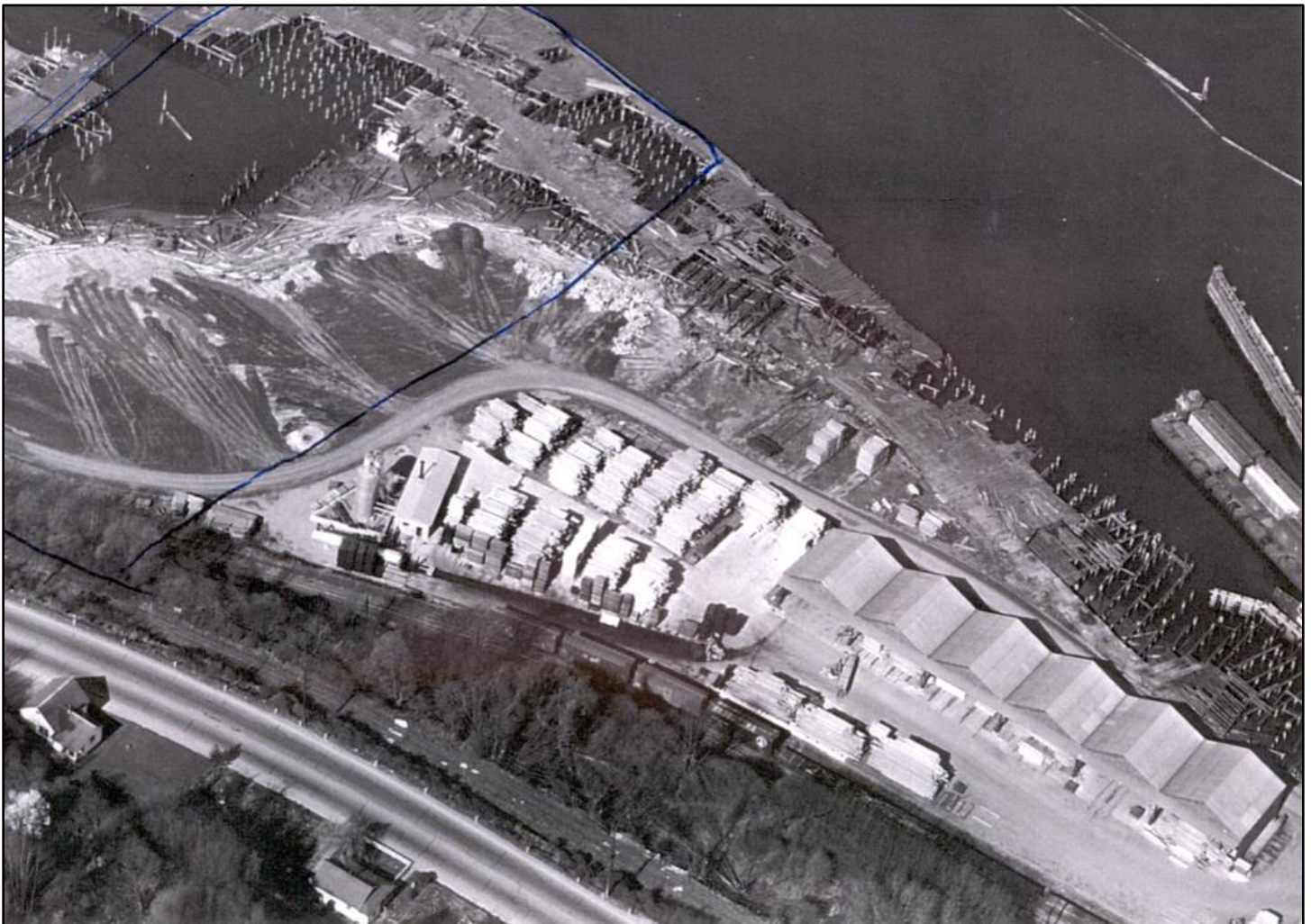
RG Haley Site aerial photo-1953

Other contaminants from nearby overlapping sites are also present. They include mercury in sediment from the Whatcom Waterway site, and municipal refuse, phthalates, metals and PCB's from the Cornwall Landfill site. Ecology is overseeing cleanup-related activities at these sites as well.