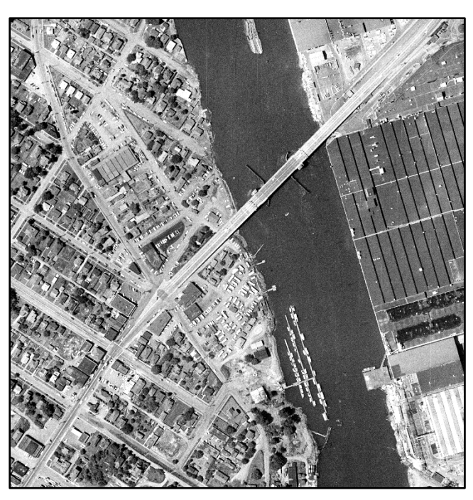
South Park Marina historical picture