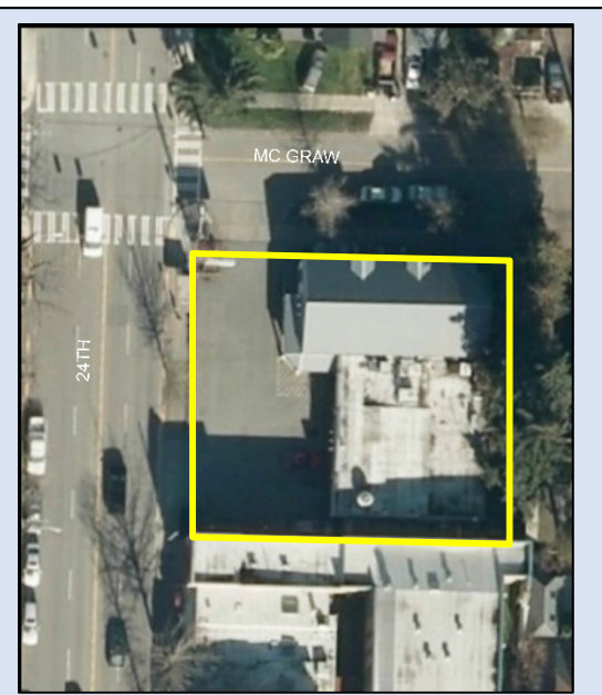
Location of cleanup site at southeast corner of McGraw St. and 24<sup>th</sup> Ave. in Montlake Neighborhood, Seattle