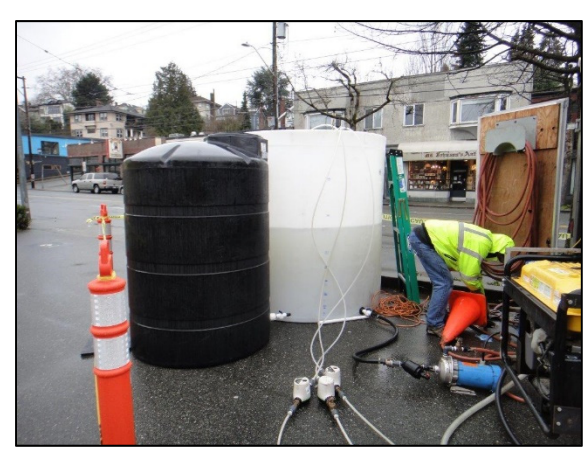
Field work during 2017 Pilot Study testing