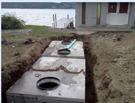
Figure 3 New septic tanks.