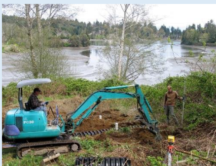
Figure 2 An excavator replaces a drainfield on a Puget Sound inlet.