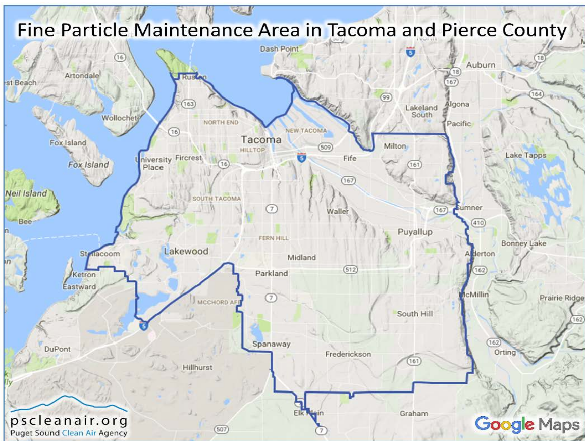
Figure 1: Map of Fine Particle Maintenance Area in Tacoma and Pierce County

In 2012, the only area that did not meet the NAAQS was the Tacoma-Pierce County area shown in Figure 1. EPA classified this location as a nonattainment area (not meeting the NAAQS) for 24-hour fine particle ( PM_{2.5} ) pollution in 2009. The primary cause of poor air quality was wood smoke from home heating during winter evenings with cold temperatures and low wind speeds.