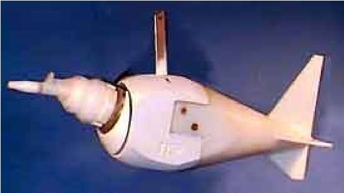
Figure 2. US DH-95 complete assembly.