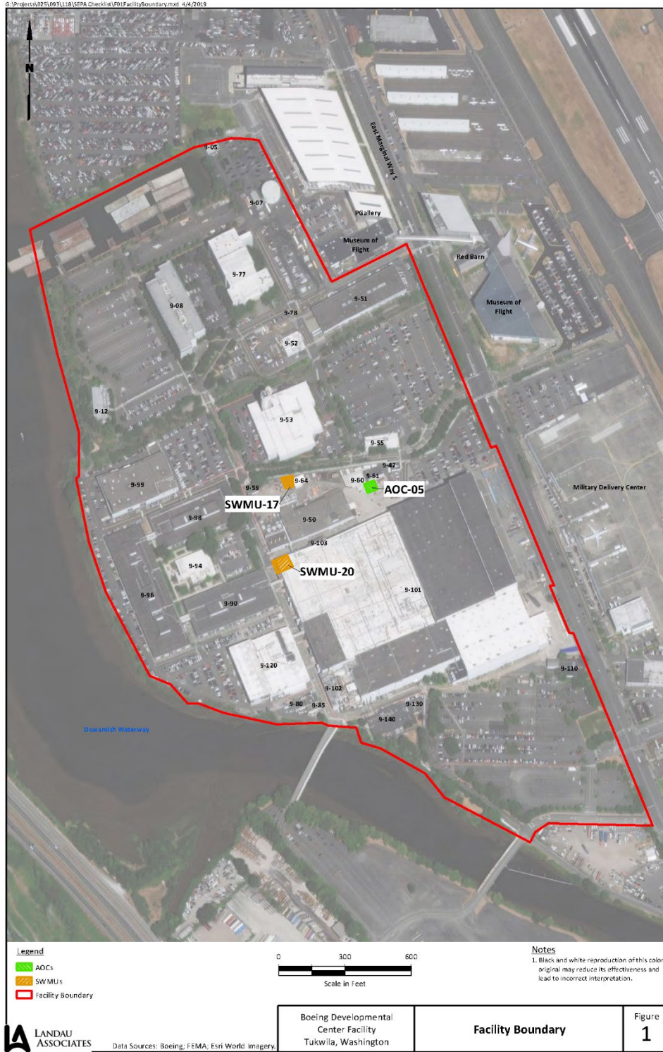
Figure 1. Map of Boeing Developmental Center property with three areas currently being cleaned up.