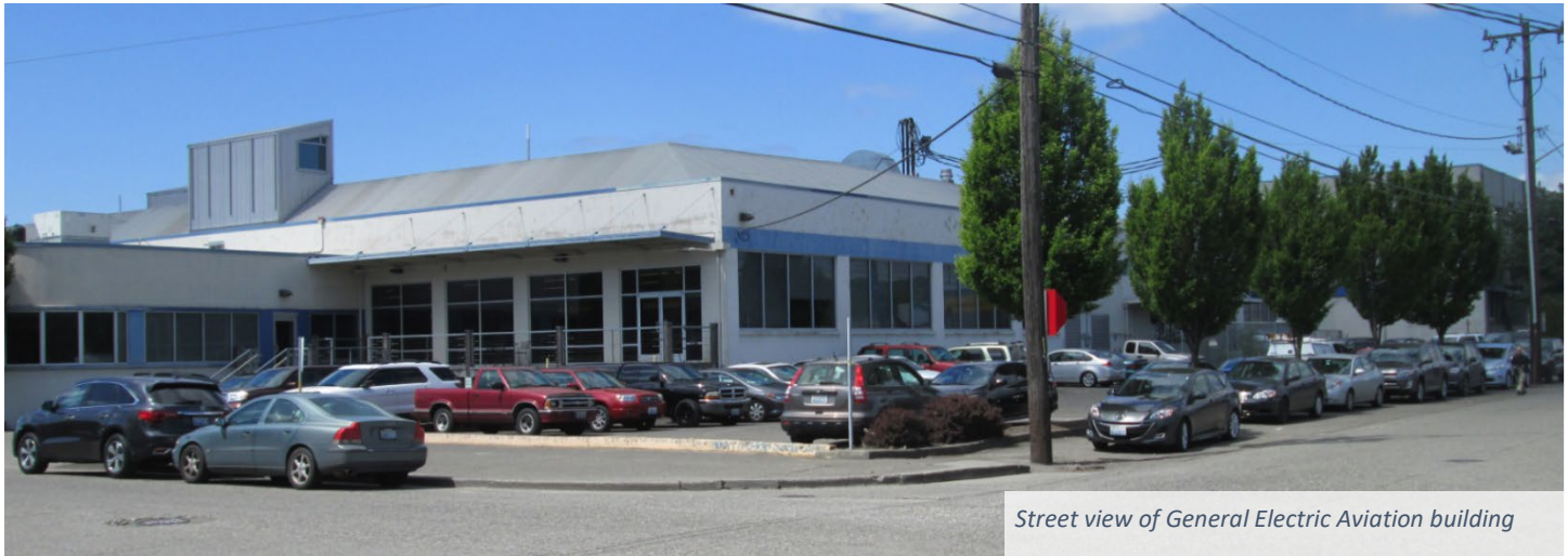
Street view of General Electric Aviation building