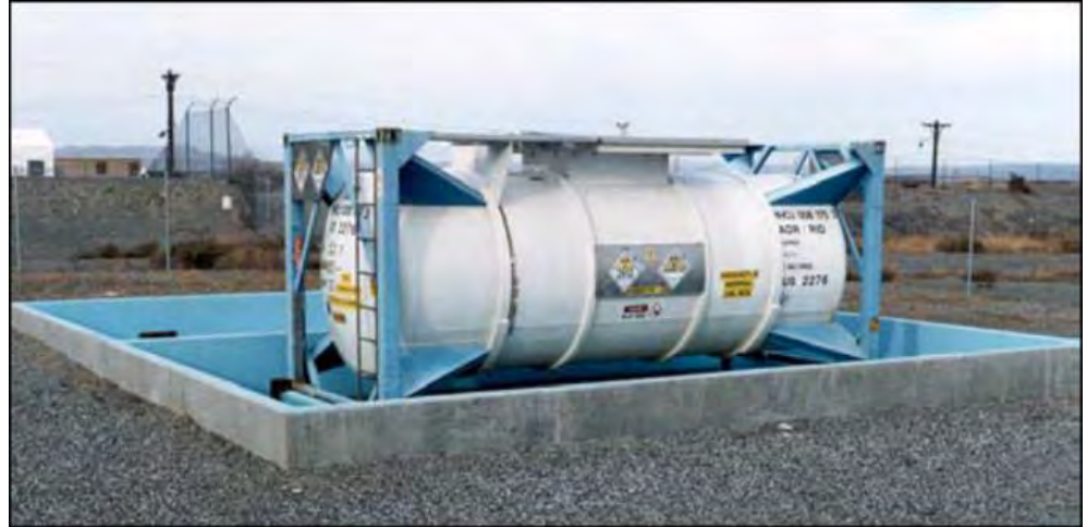
Figure 2 - 276-BA Organic Storage Area including the ISO-East container