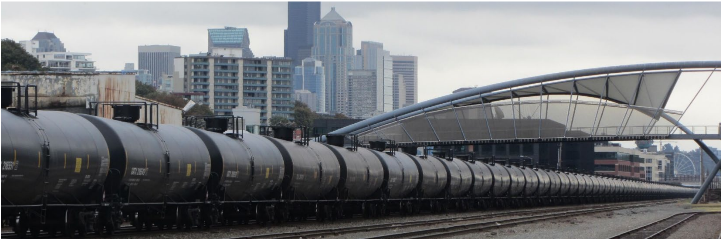
Oil unit train passing through downtown Seattle, Washington.