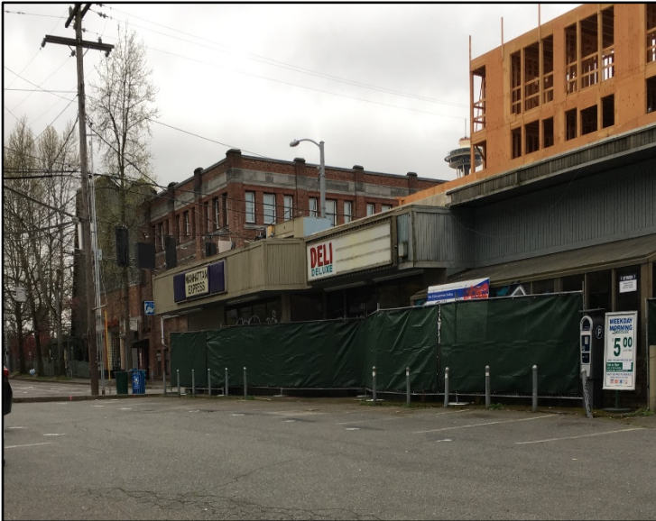
Texaco 211577 Monterey Site picture