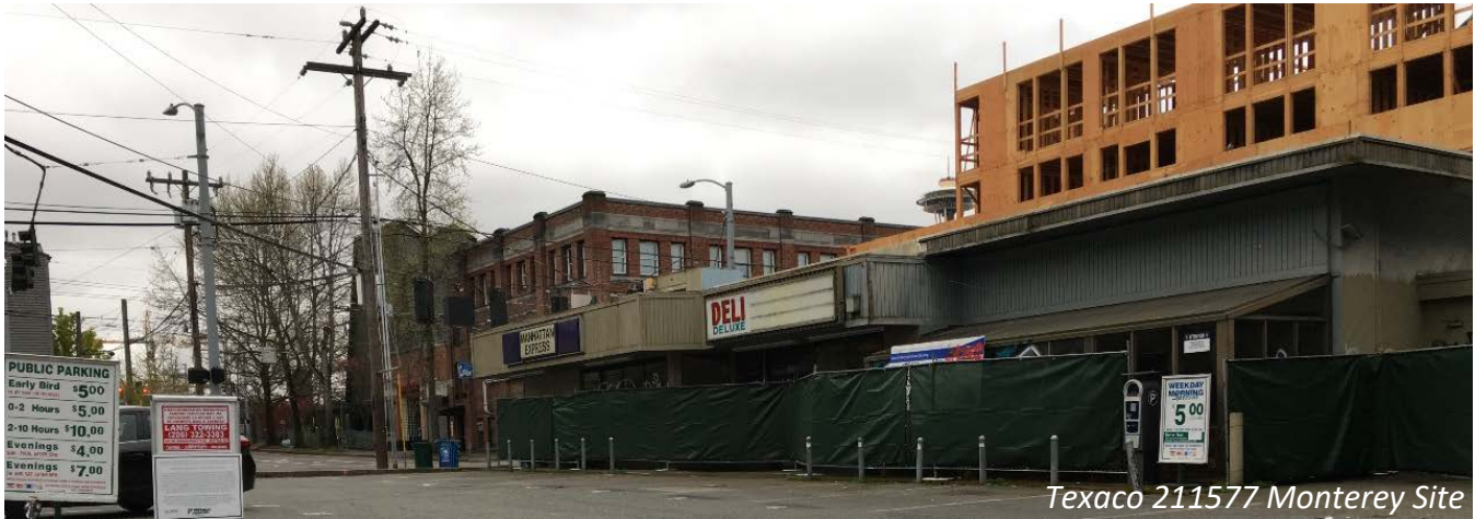
Texaco 211577 Monterey Site